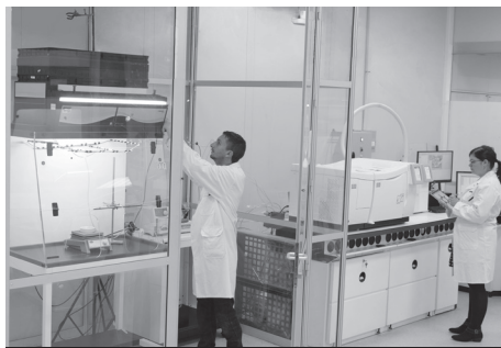
Erlab's research and filtration testing laboratory

The concentration of the chemical used for the test downstream of the filter must not exceed 50% of the authorized Occupational Exposure Limit. This phase must not be less than 1/12 of the duration of the normal operating phase.